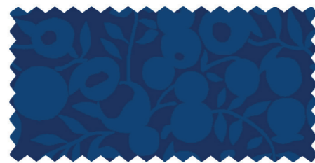
ROYAL BLUE 01666547A