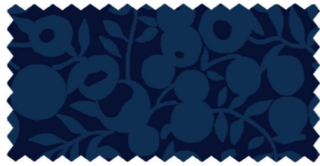
MIDNIGHT INK 01666550A / 04775706Z