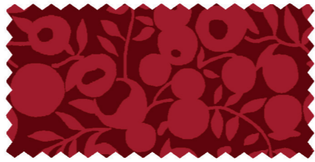
CHERRY 01666516A / 04775684Z