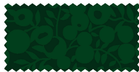
FOREST 01666559A / 04775707Z