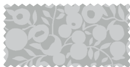
DOVE 01666566A / 04775711Z