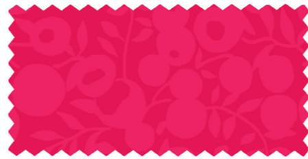
BRIGHT FUSCIA 01666523A