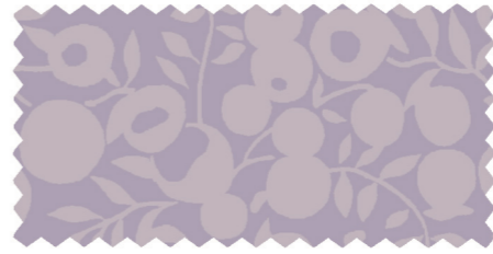
DUSKY LILAC 01666528A / 04775691Z