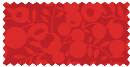
RUBY 01666515A / 04775683Z