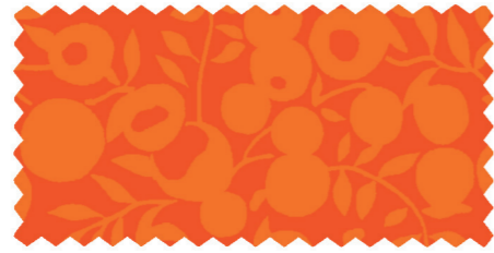
ORANGE PEEL 01666512A