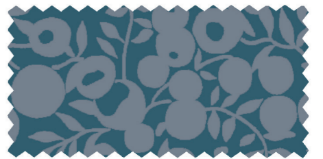
DENIM 01666536A / 04775695Z