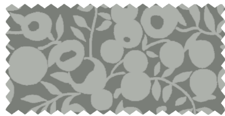
SMOKE 01666567A / 04775712Z