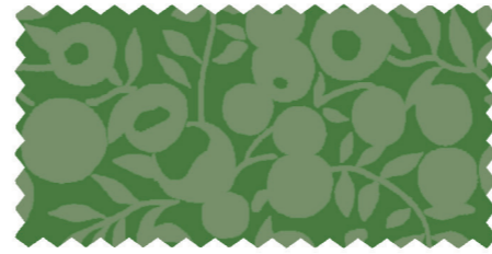
LEAF 01666557A / 04775709Z