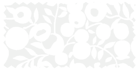
WHITE 01666501A / 04775715Z