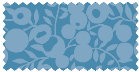
LAKE BLUE 01666537A / 04775696Z