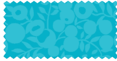
POOL BLUE 01666544A