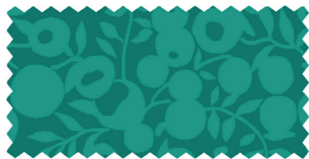
PEACOCK FEATHER 01666554A