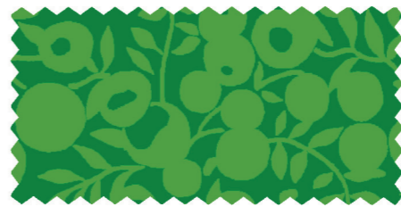
APPLE 01666561A / 04775708Z