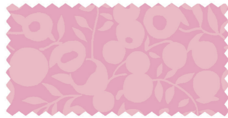
DUSTED VIOLET 01666529A