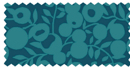
AZURE 01666548A / 04775704Z