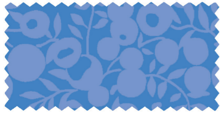
CORNFLOWER 01666538A / 04775697Z