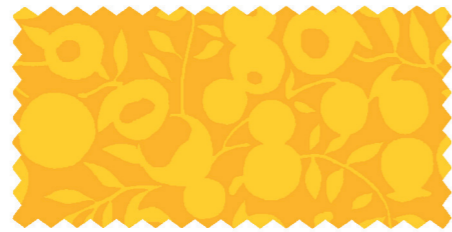
LEMON 01666509A / 04775681Z