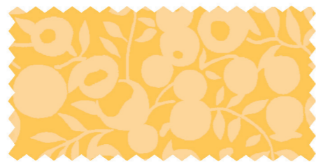
PRIMROSE 01666507A / 04775679Z