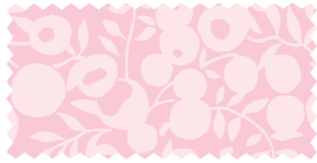
PETAL 01666517A / 04775686Z