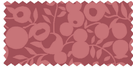
RHODODENDRON 01666526A / 04775690Z