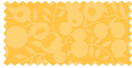
CUSTARD 01666508A / 04775680Z