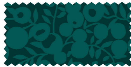
JADE 01666555A / 04775705Z