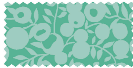
SAGE 01666558A / 04775710Z