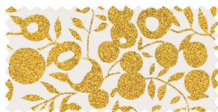
GOLD 01666572A / 04775755B