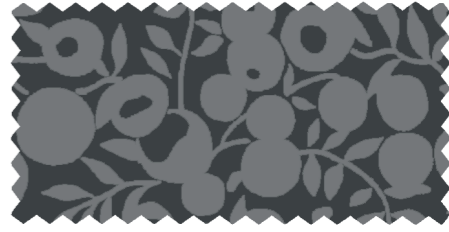
GRANITE 01666569A / 04775713Z