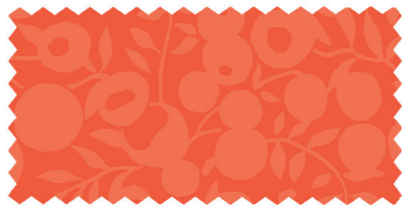
WATERMELON RED 01666513A