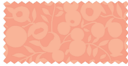
PEONY BLUSH 01666520A