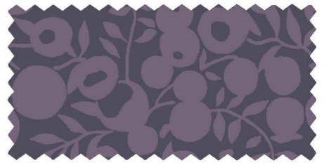
LAVENDER 01666534A / 04775692Z