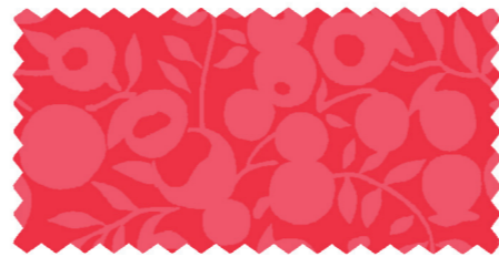
RASPBERRY 01666524A / 04775689Z