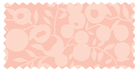
BALLET SLIPPERS 01666519A