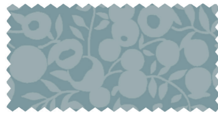
STORM 01666543A / 04775701Z