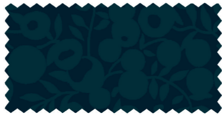
NAVY BLUE 01666551A