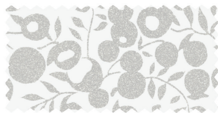
SILVER 01666571A / 04775755A