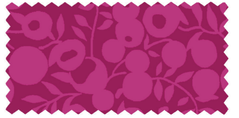
JEWEL PURPLE 01666532A