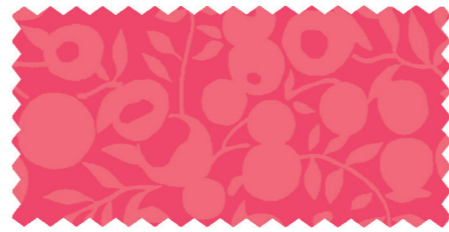
CANDY PINK 01666522A