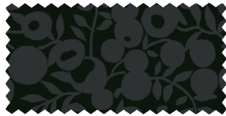
BLACK 01666570A / 04775714Z