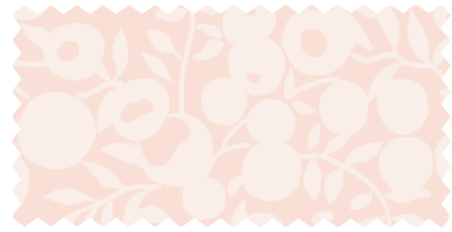
OYSTER WHITE 01666503A / 04775678Z