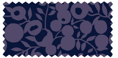
IRIS 01666535A / 04775693Z